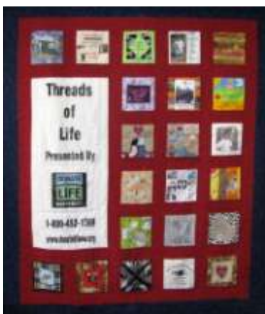
2009 Quilt Presentation – 11 th Threads of Life Quilt.

As we do each year, we eagerly look forward to receiving squares for the new quilt panel. Please contact Donate Life Northwest at 503-494-7888 or info@donatelifenw.org if you have questions.