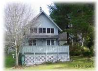
Charming cottage in Yachats, OR.

Buy tickets online today. All proceeds benefit Donate Life Northwest. Contact Susan at chrzanow@ohsu.edu or 503.494.5388 to learn more.