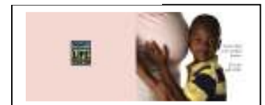
Mother’s Day Card

A Gift of Life Rose will be donated to The Oregon Garden with a dedication ceremony planned for early summer.