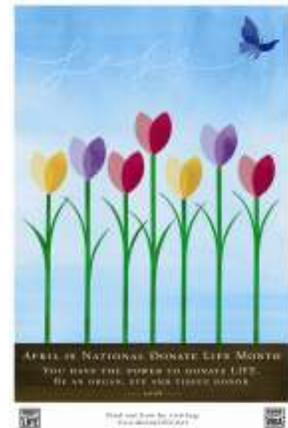
National Donate Life Month Posters