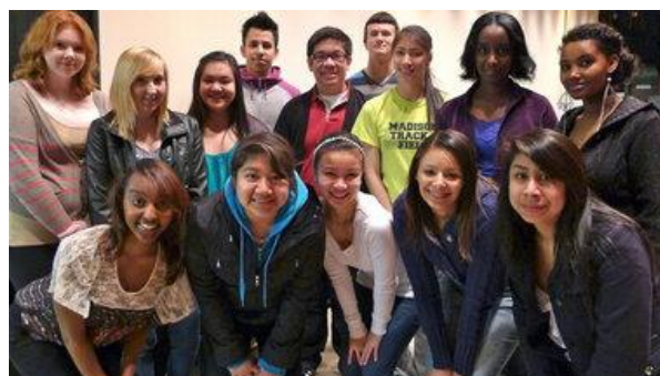
Madison High School students.