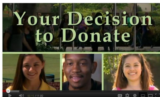
Teen friendly video included in every "Teacher Kit"

How does Donate Life Northwest spread the word about donation? This year, Education Outreach has focused its efforts on teacher outreach in an attempt to identify and form relationships with health, science and driver's education teachers throughout Oregon and SW Washington. Although donation education is not mandatory within the Oregon state curriculum, many teachers actively support donation awareness in the classroom. By including it in their lesson planning, they can potentially reach up to 150 students!