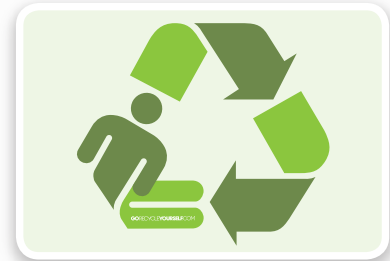
GoRecycleYourself message resonates across generations