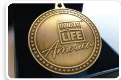
Oregon and Washington receive 2011 Gold Medals