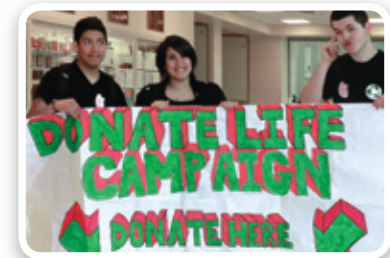
Student projects result in all-school assemblies, community concerts, registry drives