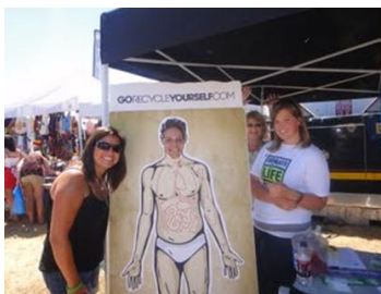
Students volunteering and having fun!