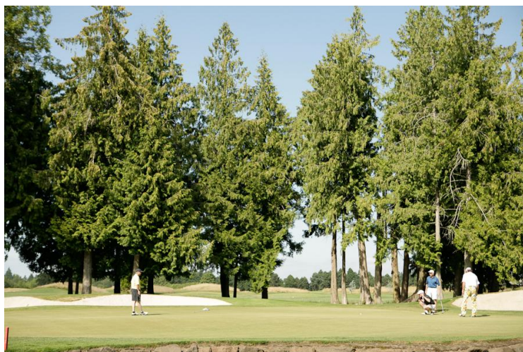
The 19 th Annual Golf Tournament will take place August 7 th at the Reserve Golf Club, Aloha, OR.

Contact 503.494.7888 for more information.