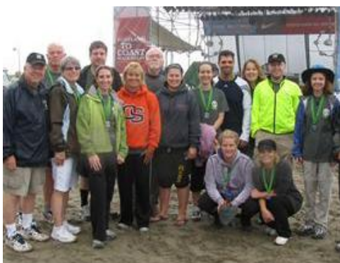
2011 Transplant Trotters Team

Oregon and SW Washington's own Transplant Trotters are seeking new team members to join the Portland-to-Coast walk relay: 5-6 walkers, 1 driver and 1 team volunteer. The event is all about FUN and celebrating 2 nd chances - decorating vans, creating special team apparel and cheering each other on through the 24-hour walk relay to the coastal finish line where the real party begins. It's a great way to showcase the importance and power of donation!