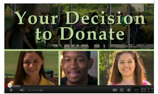
Teen friendly video included in every "Teacher Kit"

How does Donate Life Northwest spread the word about donation? This year, Education Outreach has focused its efforts on teacher outreach in an attempt to identify and form relationships with health, science and driver's education teachers throughout Oregon and SW Washington. Although donation education is not mandatory within the Oregon state curriculum, many teachers actively support donation awareness in the classroom. By including it in their lesson planning, they can potentially reach up to 150 students!